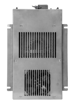
Backer Vestibile Heater